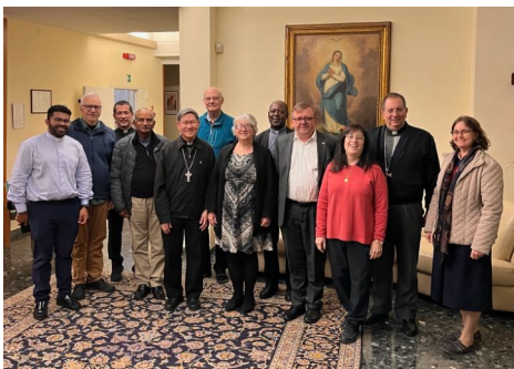
CBF member institutions worldwide

The regional and subregional coordinators have the task of promoting biblical pastoral ministry in their own regions and of coordinating it with the support of the General Secretariat. All the coordinators work on a voluntary basis.